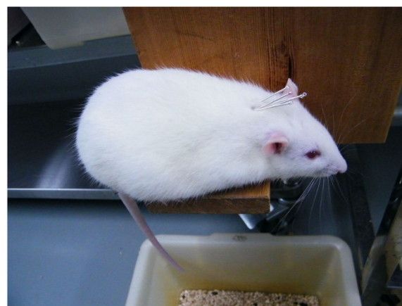
Figure 1 Rats on the suspended shelf. For the convenient manipulation of the acupuncture points on the back, rats were placed on the suspended shelf (50 × 45 mm, approximately 50 cm high from the ground), which calmed the rats and allowed them to stand still without anesthesia.

Protein (100 µg) was loaded onto 17 cm IPG strips with a linear separation range of pH 3–10 (Bio-Rad, Hercules, CA), which were subsequently rehydrated for 12 h at 50 V, 20°C. First-dimensional isoelectric focusing (IEF)